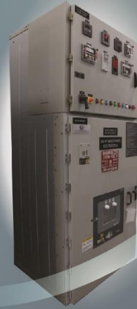
33 KV VCB / MV PANEL