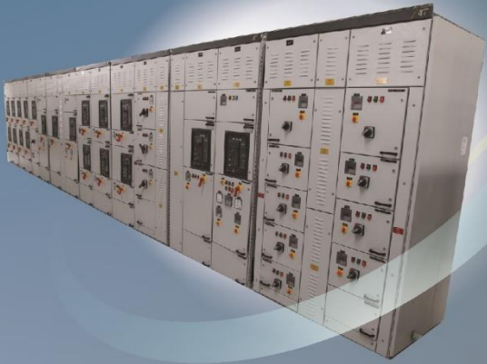
TTA (Ti) DESIGN PANEL