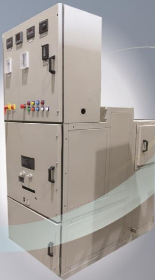
11 KV VCB / MV PANEL